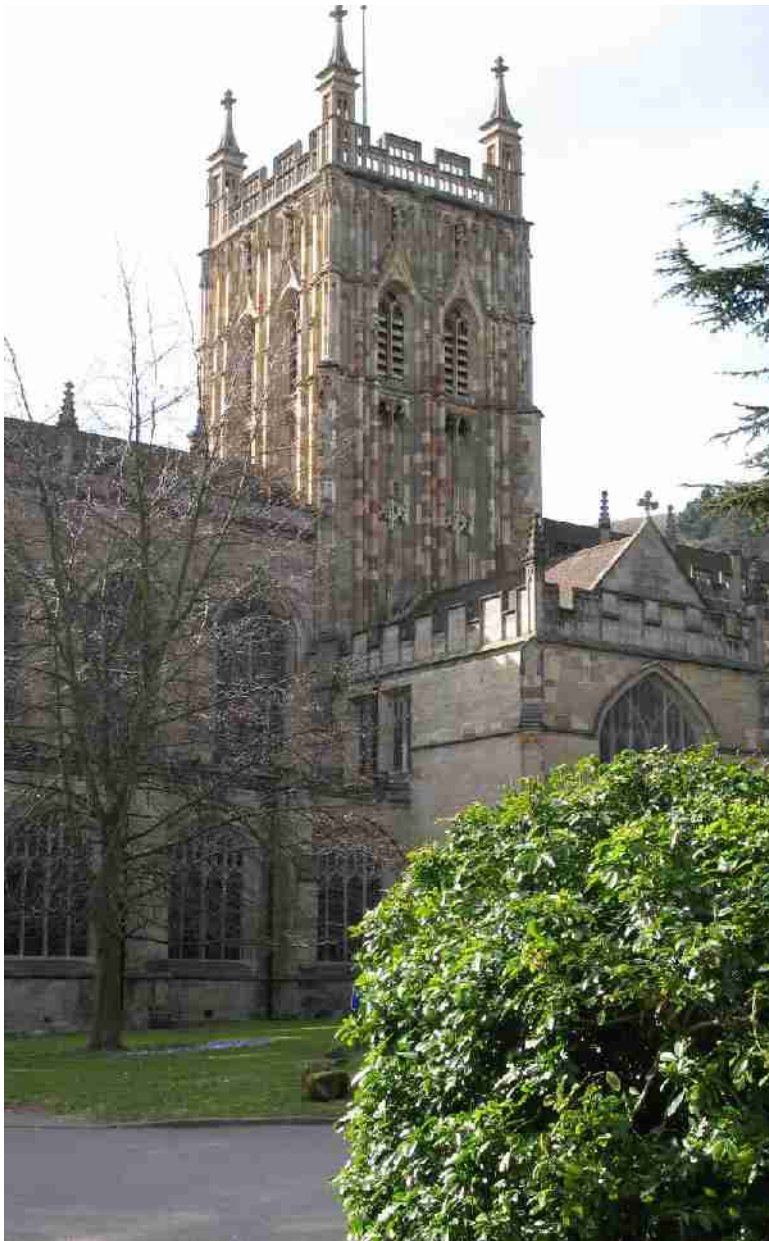
The Parish Church of St. Mary & St. Michael