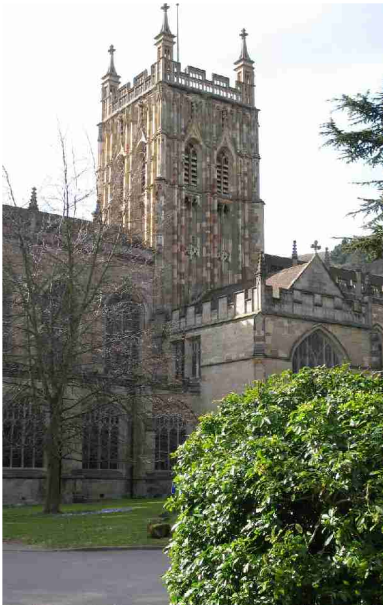
The Parish Church of St. Mary & St. Michael