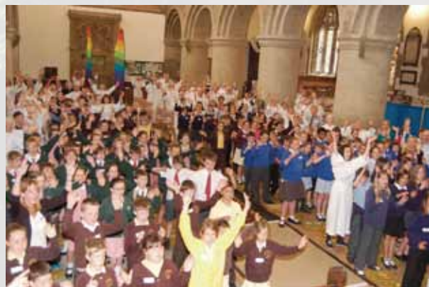
Life-path is a Scripture Union inspired local church/school event, held in the Priory for a week every June.

John 3:16 from the NRSV translation of the Bible.