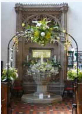
Detail from a recent flower festival

In 2010 we celebrated our 925th anniversary with a Science and Faith week and a spectacular Son et Lumière bringing to life the history of Malvern and its Priory.